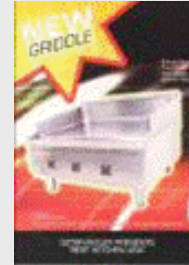
Clad Plate Griddle (OZTIRYKILER)