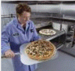
Dual Conveyor Oven (Avantec)