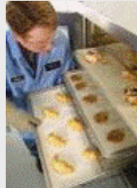
Cross Flow Oven (Avantec)