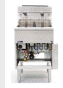
High Efficiency Fryer (Pitco)