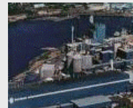
METHANE de-NOX (Takuma, ESA)