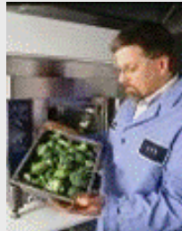
Gas-Fired Steamer (Victory Refrigeration Stellar Sirius)