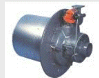
Cyclomax Burner (Maxon)