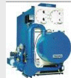
Cyclonic Boiler (Takuma)