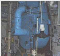
FIR Burner (Johnston, Peabody, COEN)